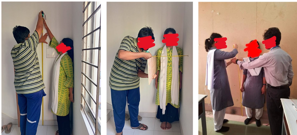
Figure 2: Students taking body measurements.

The study limitations include small sample size, lack of high-quality measuring instruments, specific reference to service function etc. As the study was carried in the design studio, therefore it was not possible to conduct a random survey of a large sample size representing the national population, and in this case, convenience sampling was the rational choice. It was a student exercise, therefore, there could be human error in precision and accuracy in taking each