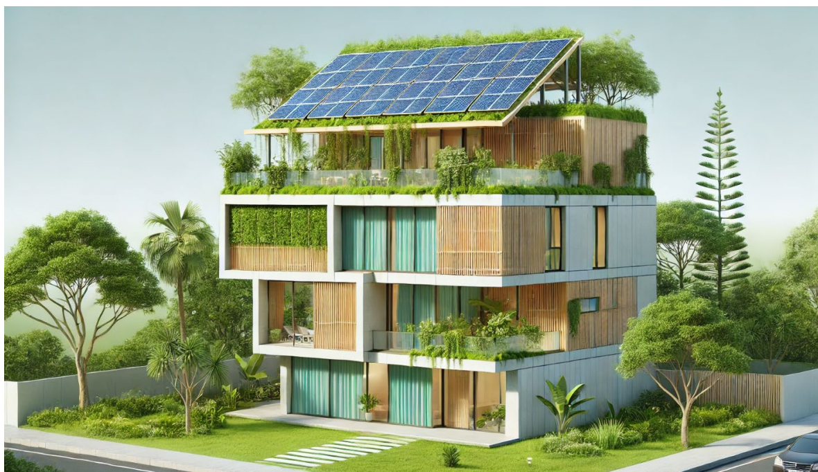
Figure 1: Green architecture

The solution to the problem lies in developing new aesthetic approaches to create transformation and change in public perception and replacing the current degenerate patterns with ecological patterns based on the balance of energy conservation and optimization, and respect for the natural and social environment. This requires that architects strive to guide public taste in constructive and socially beneficial directions instead of following popular and market-driven tastes. Architects can make people believe that climatic and environmental designs are no less beautiful than the current prevalent decorations. Through architecture, society can be informed about the great economic and environmental value of energies that have become renowned for their calm and comfort. From the perspective of artists and architects, these energies can be considered beautiful above all else. The future of the world lies in the discovery of the beauty inherent in clean and life-giving energies. Let's discover the beauty hidden in clean and life-giving energies. Traditional architecture values and the environmental values of traditional architecture in many countries around the world possess significant value in the various ways of optimal use of energy and ecological exploitation of different types of energies,